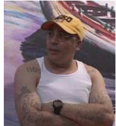
- (Frame grab from one of our productions) -

As we wish to produce RELEVANT programmes, when we produce an insert on a RAP artist, we try to make him look the part (see pic left above). Inserts on the work done by Correctional Officials also forms part of these programmes in order to encourage the working together of offenders and Correctional Officers.